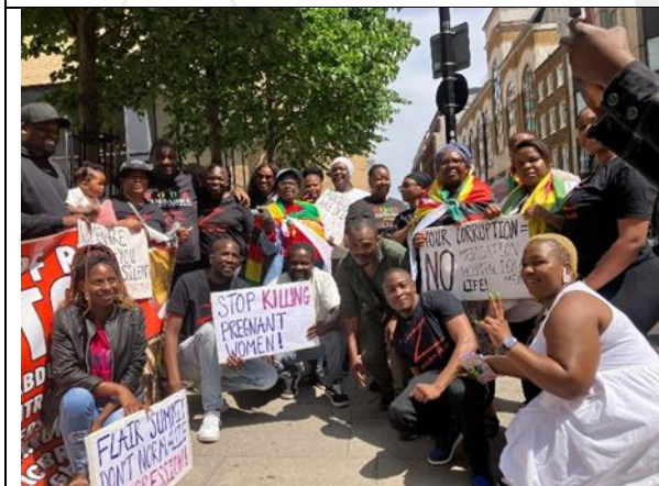
17 th June 2025 – Leonardo Royal Hotel Auxilla Protest