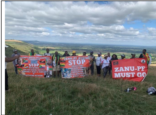
9 th and 10 th August 2025 105km Walk for Freedom

ZHRO is focused on activism and public awareness to the injustices within Zimbabwe, and to support those within the UK diaspora: UPDATED 26 th August 2025