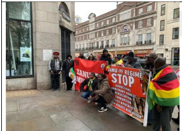
20 th February 2025 No to ED20230