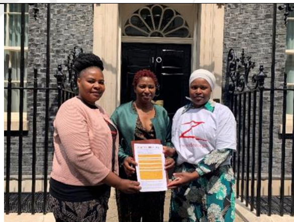
4 th June 2025 Petition to 10 Downing St and FCDO regarding Auxilla visiting the UK