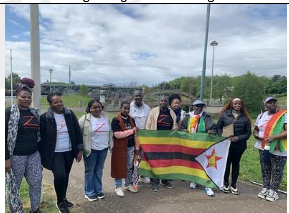
3 rd May 2025 – Stockton-on-Tess Walk 4 Freedom