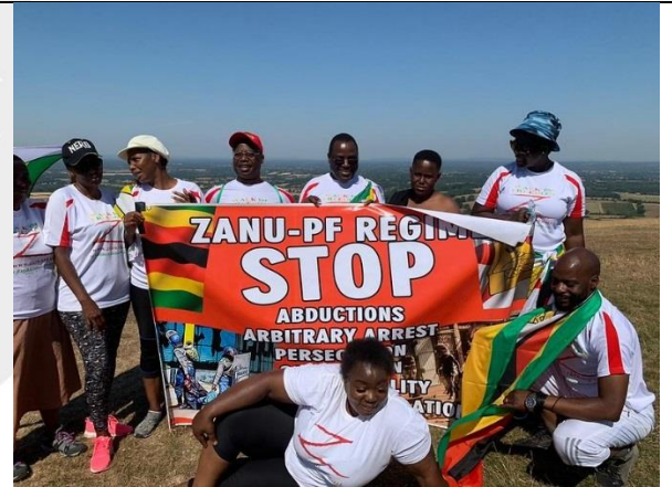
20 th August 2022 105km Walk to London