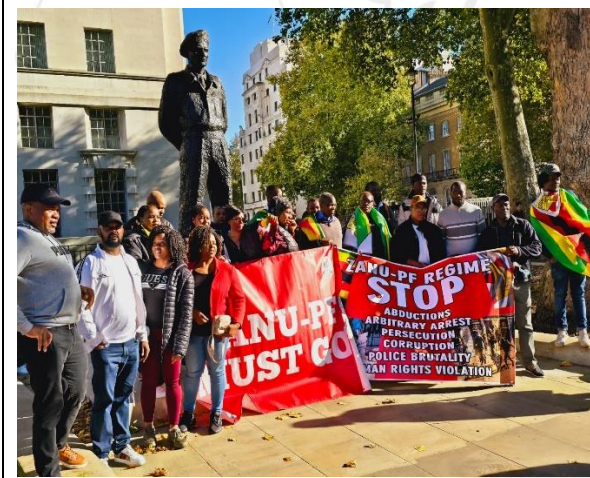
24 th October 2024 Zimbabwe Injustice