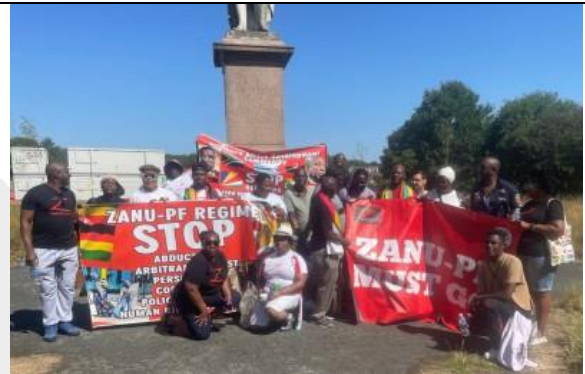
12 th July 2025 Leeds Meanwood Trail Walk