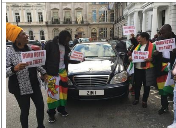
8 th Oct 2018 Mthuli Ncube Demo Chatham Ho