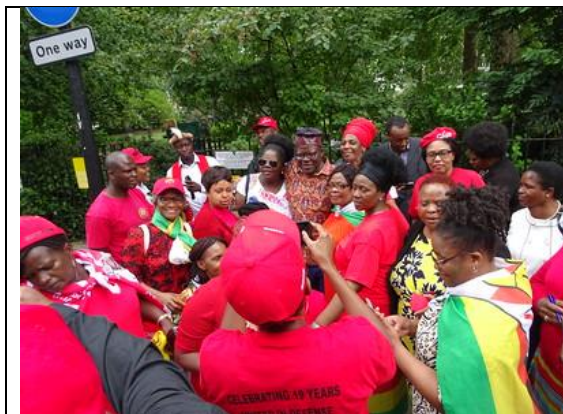
June 2019 Tendai Biti Chatham House