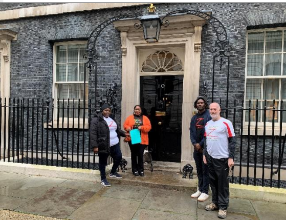
20 th February 2025 No to ED20230