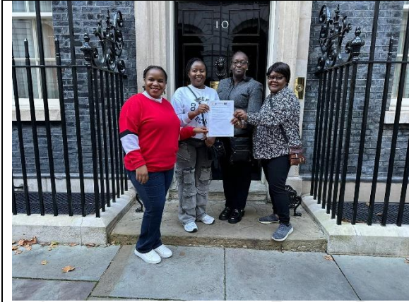
24 th October 2024 Maternal Mortality Demo