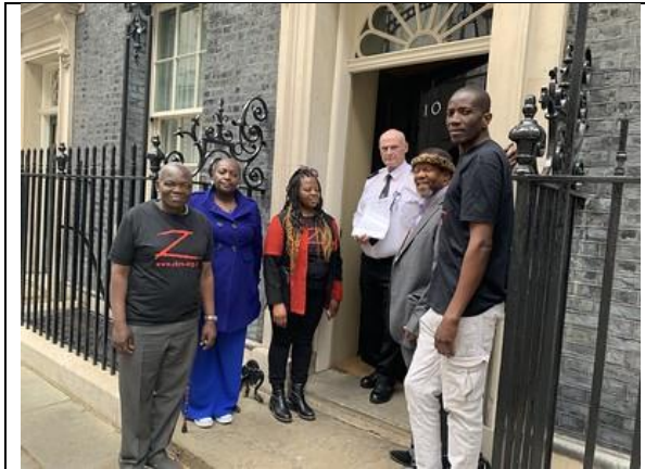
18 th April 2025 Independence Day – 45 Years