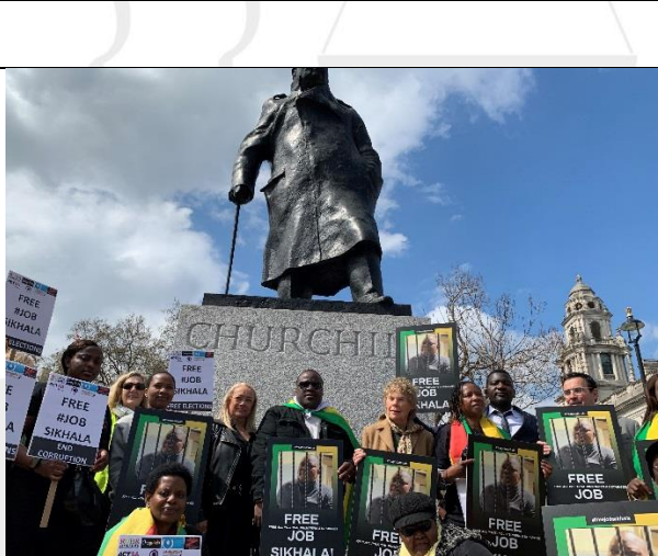
15 th Dec 2023 Outside Zim Embassy