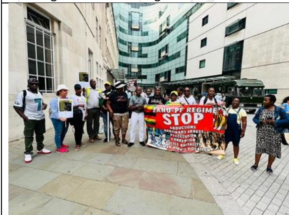
20 th July 2022 SADC Petition BBC