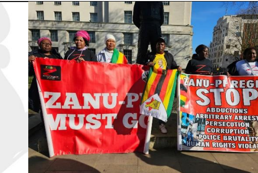
5 th March 2025