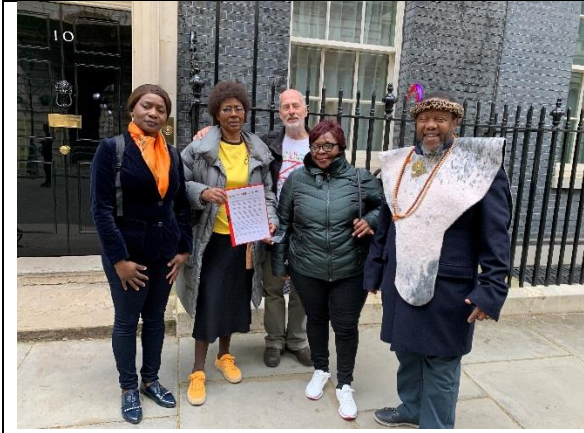
18 th Apr 2023 Gold Mafia Petition 10 Downing