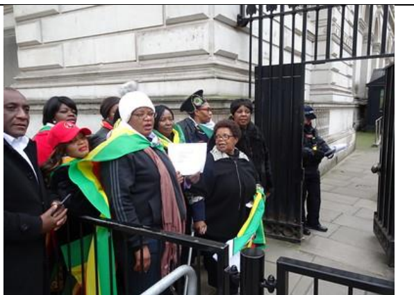
9th Jan 2019 10 Downing St Petition