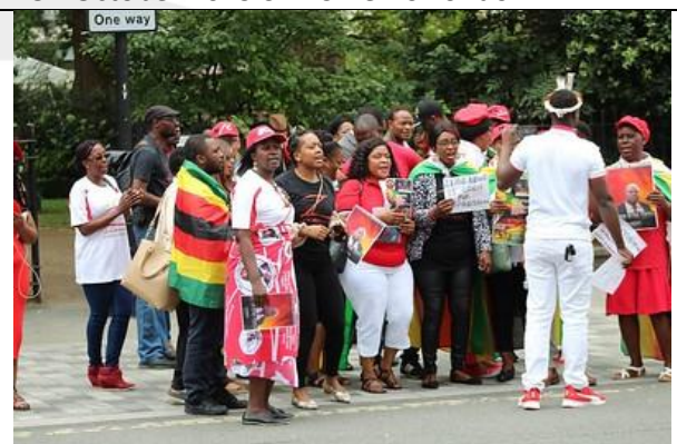
12 th July 2019 Moyo Demo Chatham Ho