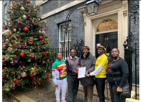
5 th December 2024 Gukurahundi Revisited