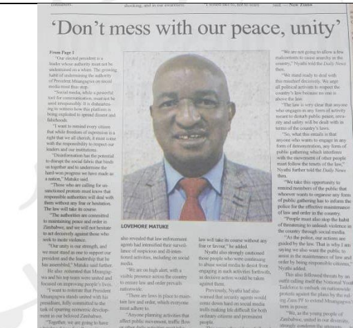
26 th Feb 2025 More Threats from Zanu PF