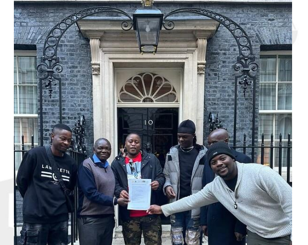
24 th October 2024 Zimbabwe Injustice