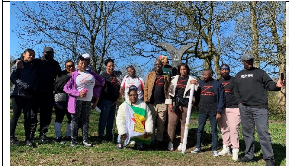
5 th April 2025 Blackburn Walk for Freedom