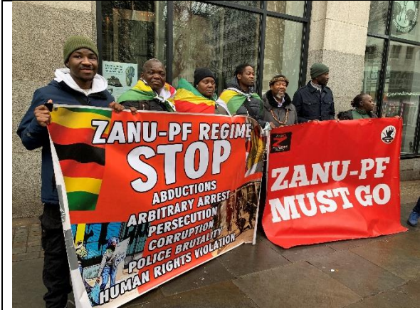
5 th December 2024 Gukurahundi Revisited