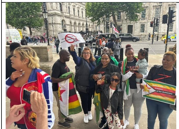
24 th May 2025 Africa Day - Petition