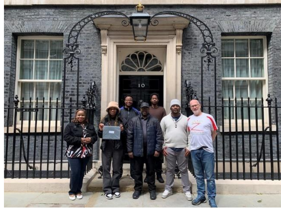
16 th Aug 2024 Zimbabwe Petition