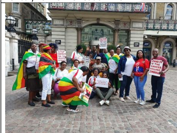
September 2019 Zanu PF Investment Protest