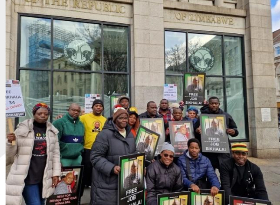
30 th May 2024 Zimbabwe Embassy Meet UP