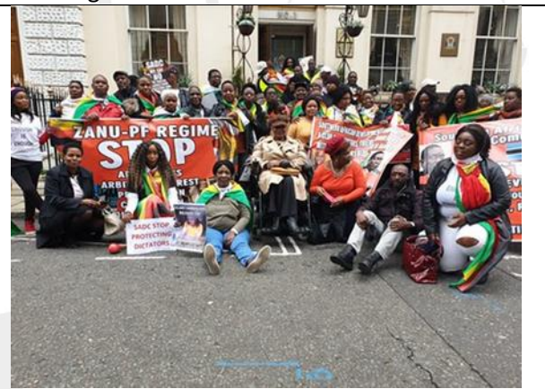
25 th October 2019 SADC Demo London