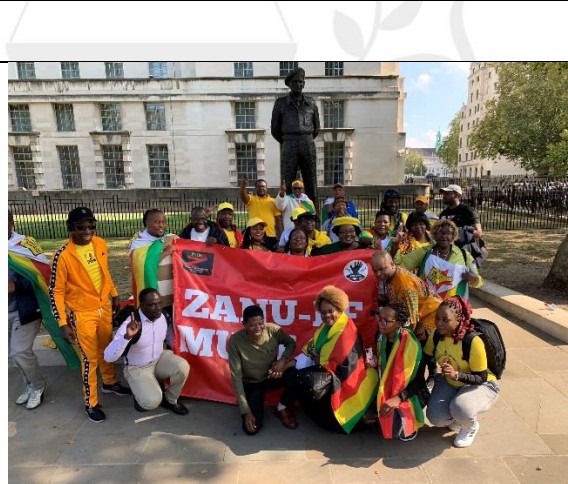
15 th Dec 2023 SA High Commission Petition