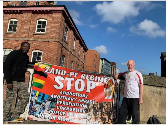
6 th April 2025 Sheffield Walk