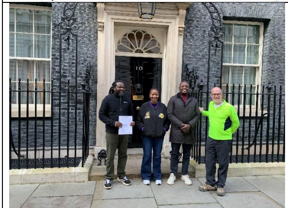
5 th March 2025 Electoral Reforms Petition