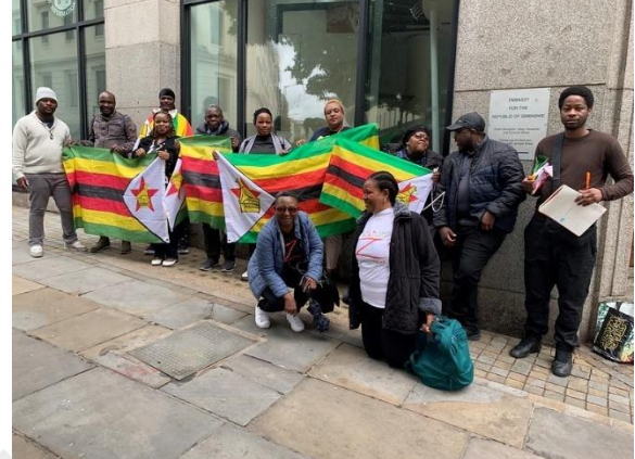
16 th Aug 2024 Zimbabwe Petition Downing St.