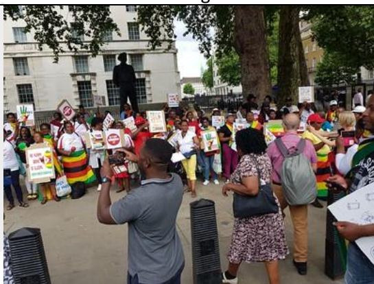
18 th July 2018 10 Downing St Petition

ZHRO have invaded the Zimbabwe Embassy, Protested in the faces of Gen Moyo, Mthuli Ncube, CIO's, Zimbabwe Ambassador and disrupted Zanu PF UK sponsored events. We have organised Walks for Freedom, Take2Zimbabwe and various themed events all over the UK.