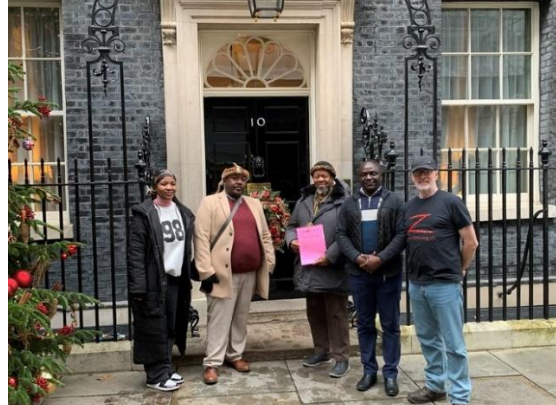
30 th May 2024 Petition 10 Downing St