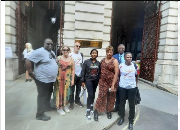
18 th August 2022 Meeting at FCDO London